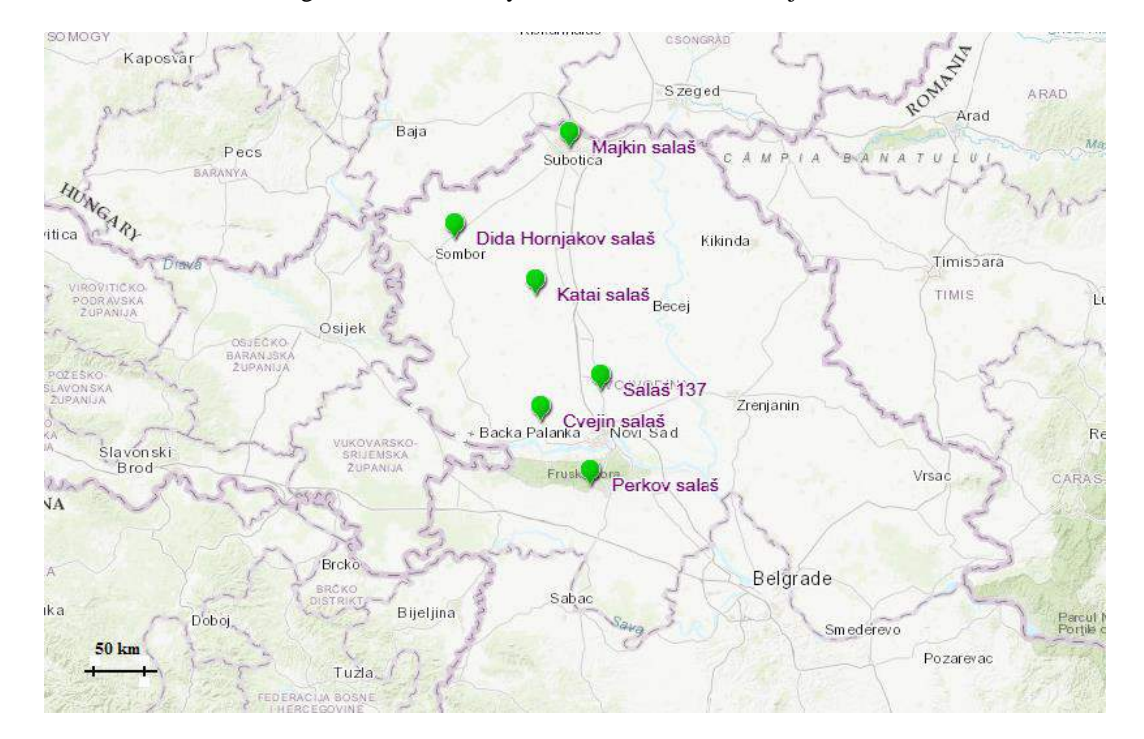
Figure 1. Territoriality of the farm houses in Vojvodina

Collected data were analyzed by employing the Statistical Package for the Social Sciences (SPSS) programme. Although there are a number of traditional farm houses (Serb. Salaš ) in Vojvodina Province (Northern Serbia), six farms attractive for tourists have been selected for the analysis in this study. The following farms have been analyzed: Dida Hornjakov salaš , located near Sombor, Salaš 137 in Čenej near Novi Sad, Majkin salaš in Palić, Katai salaš in Mali Iđoš, Cvejin salaš in Begeč, and Perkov salaš near Neradin in Fruška Gora National Park (Figure 1).